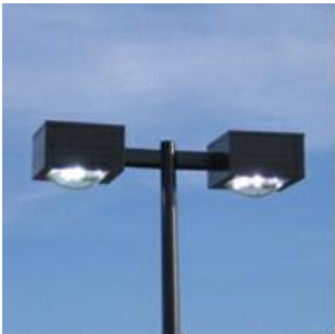
FIGURE 4: PROHIBITED SAG LENS LIGHT STANDARD