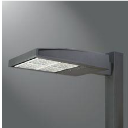
FIGURE 3: CUT OFF LIGHT STANDARD FULL