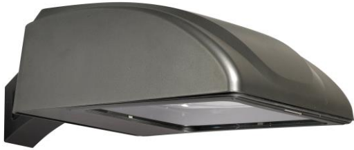
FIGURE 2: FULL CUT OFF WALL MOUNT