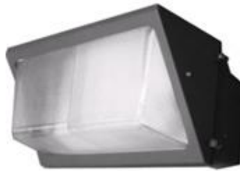
FIGURE 5: PROHIBITED WALL MOUNT